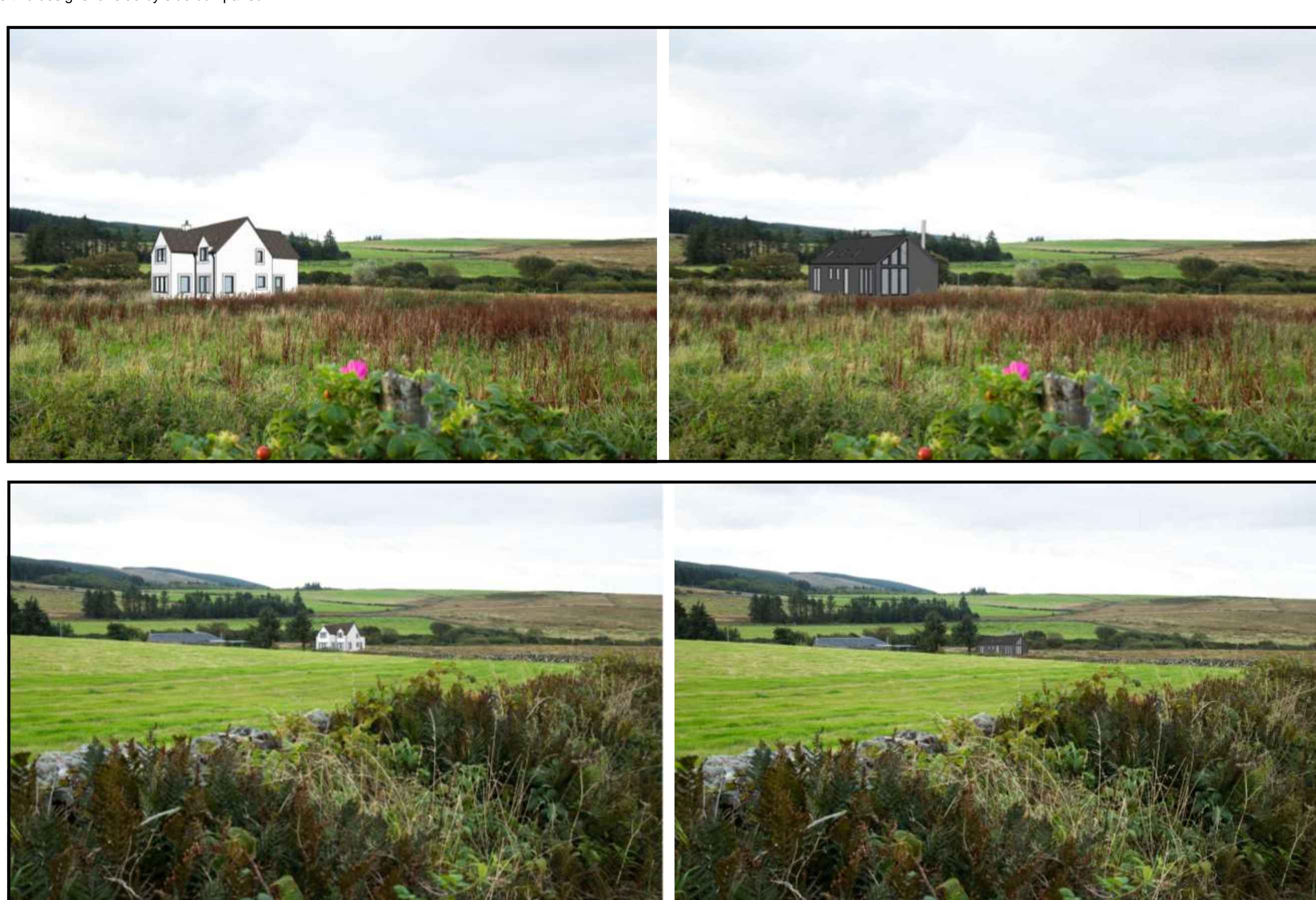
This is an example and not a formal policy assessment against either of the sites or designs contained herein.

The two designs for side by side comparison: