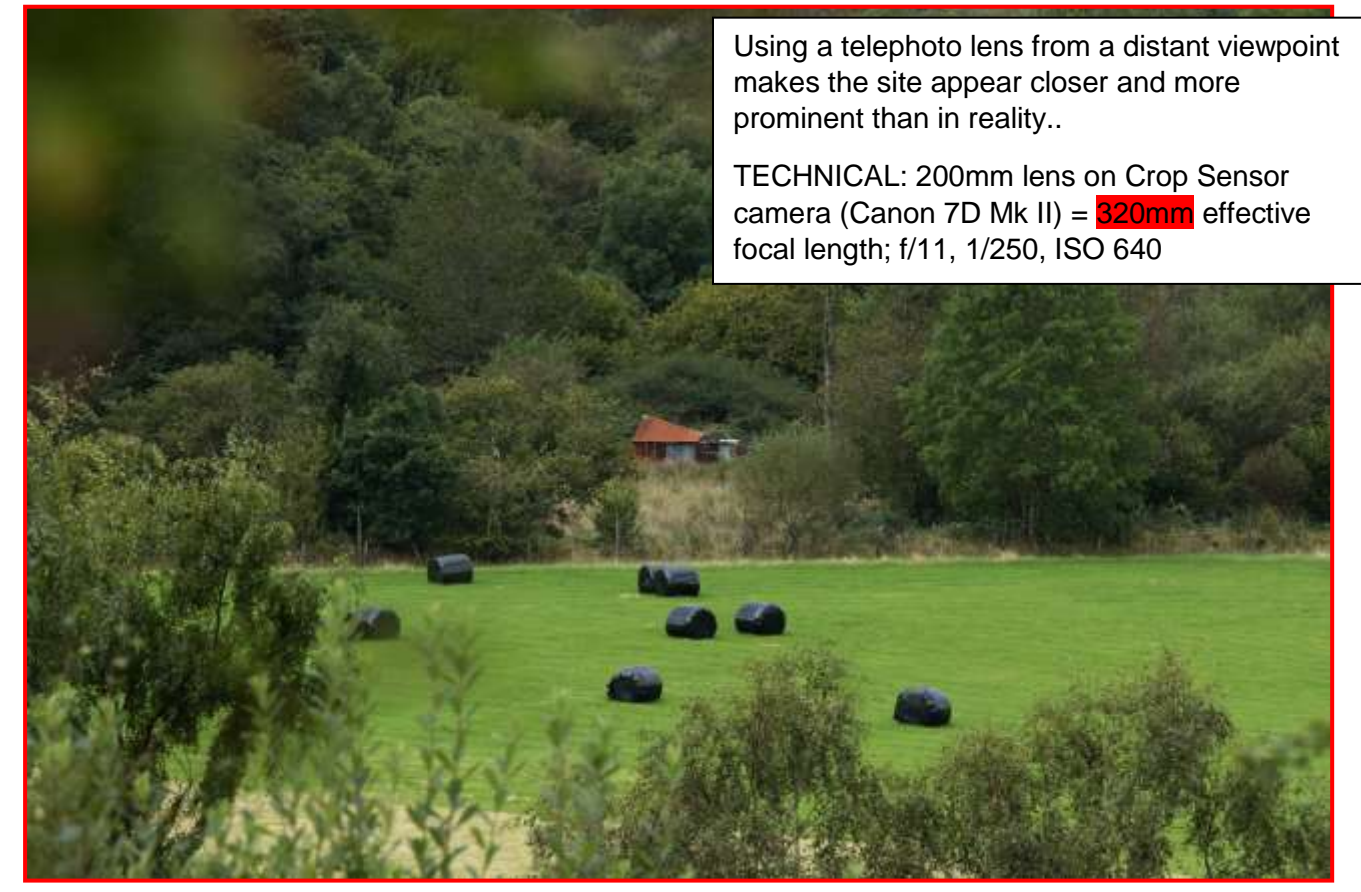
This is an example and not a formal policy assessment against either of the sites or designs contained herein.