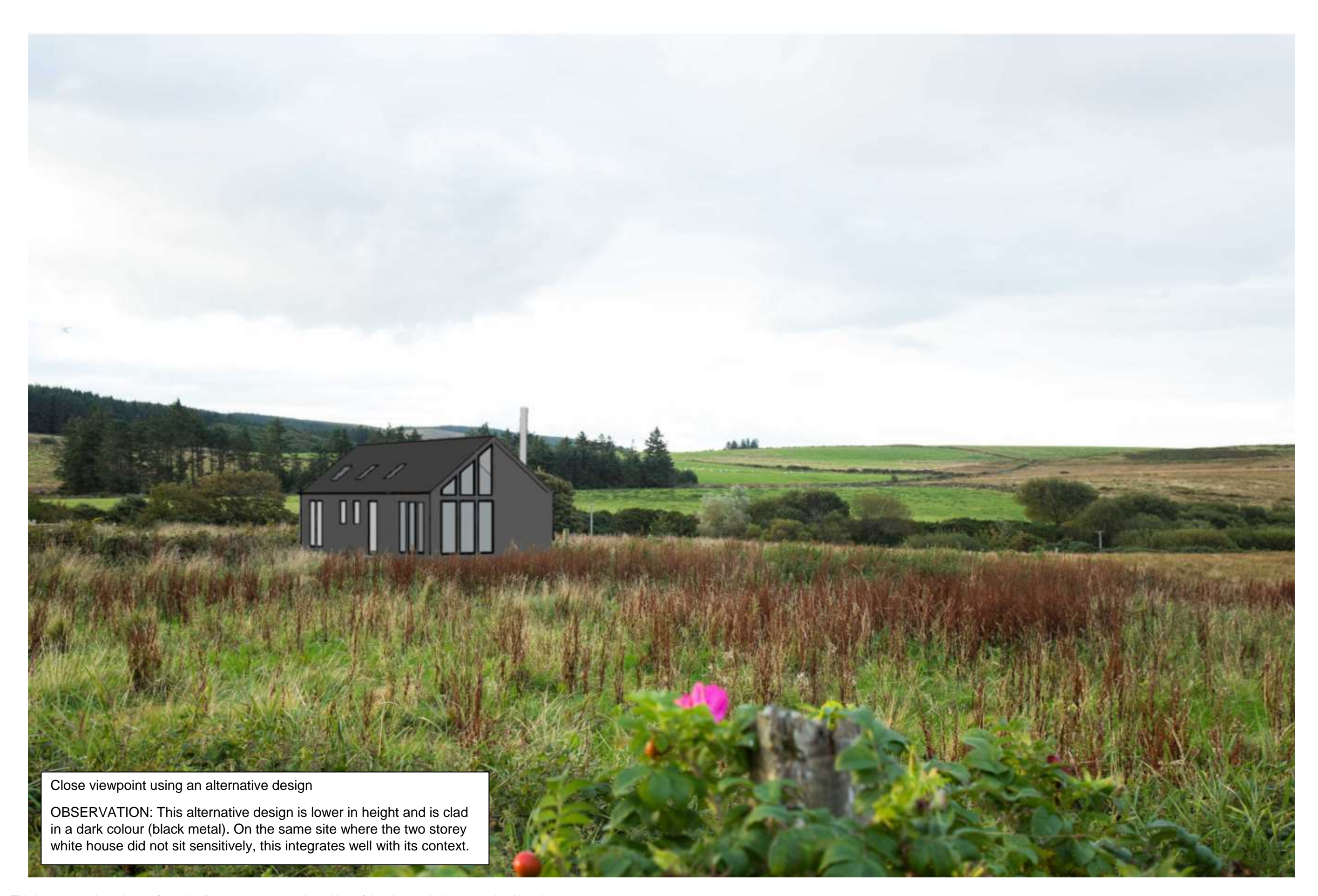
This is an example and not a formal policy assessment against either of the sites or designs contained herein.