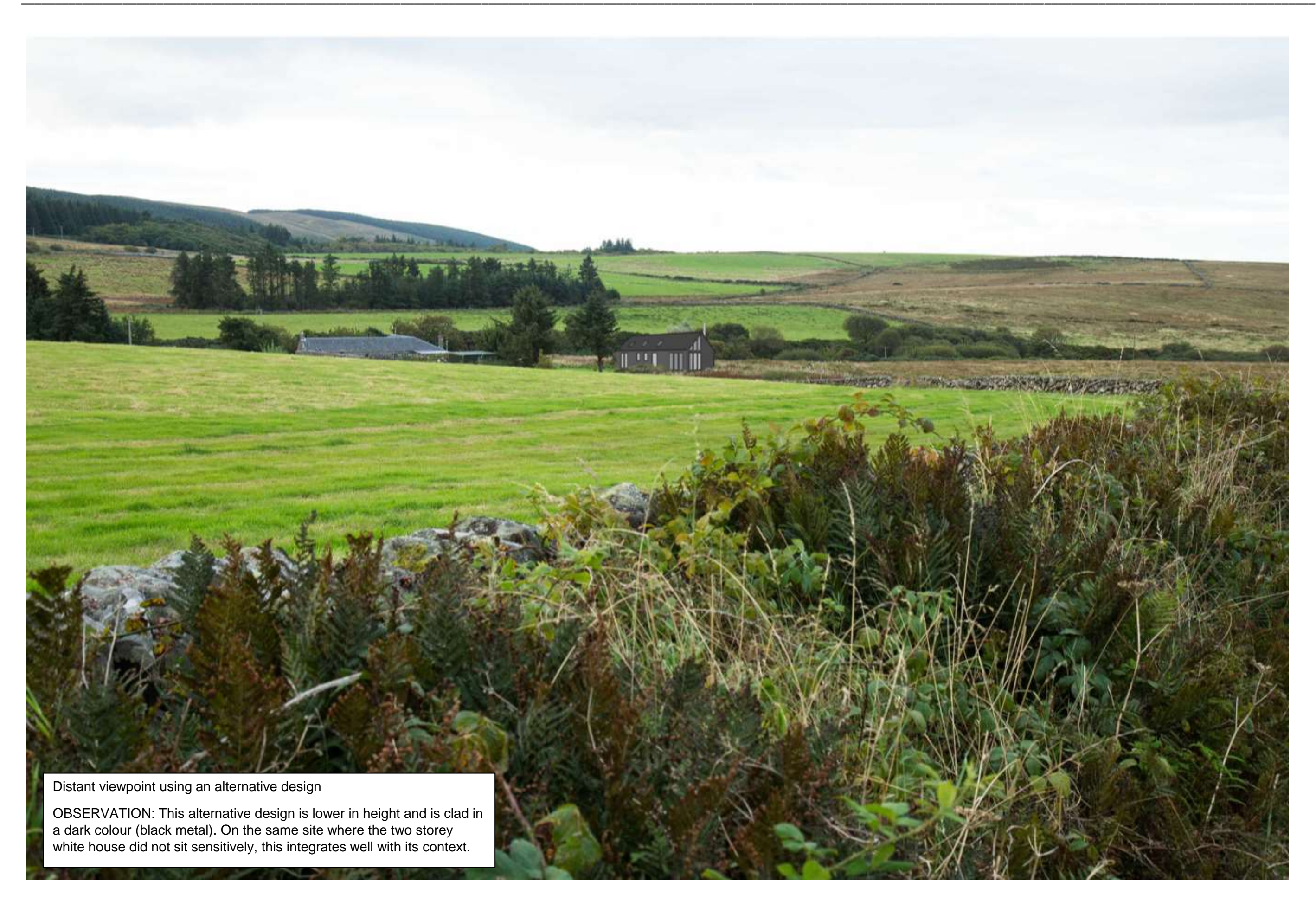
This is an example and not a formal policy assessment against either of the sites or designs contained herein.