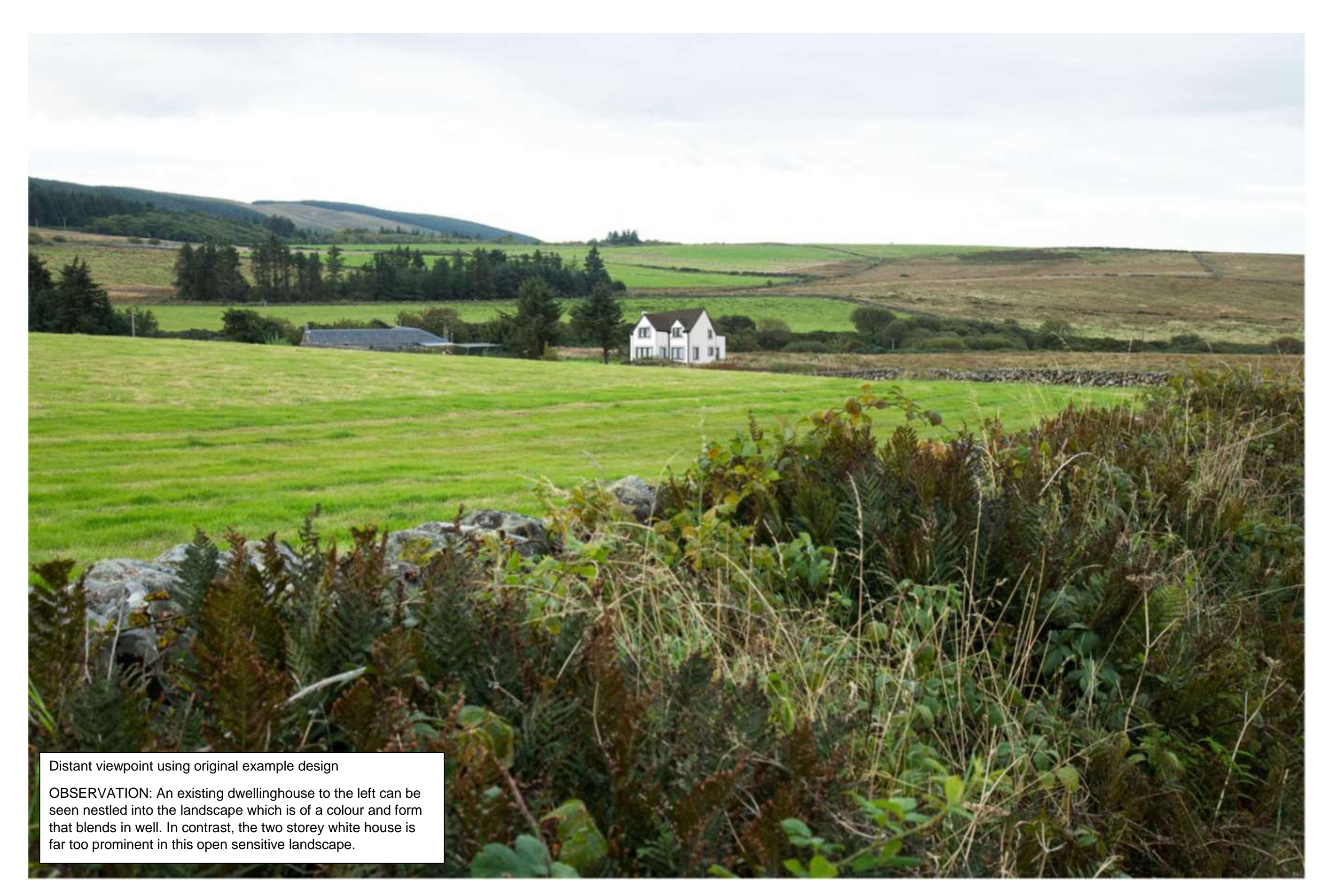
This is an example and not a formal policy assessment against either of the sites or designs contained herein.